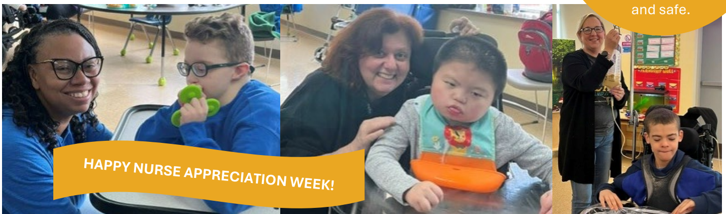
HAPPY NURSE APPRECIATION WEEK!

Our nursing team is a dynamic force dedicated to promoting our students' health and wellness. We're proud that our nursing clinic is a supportive space where students feel nurtured and safe.