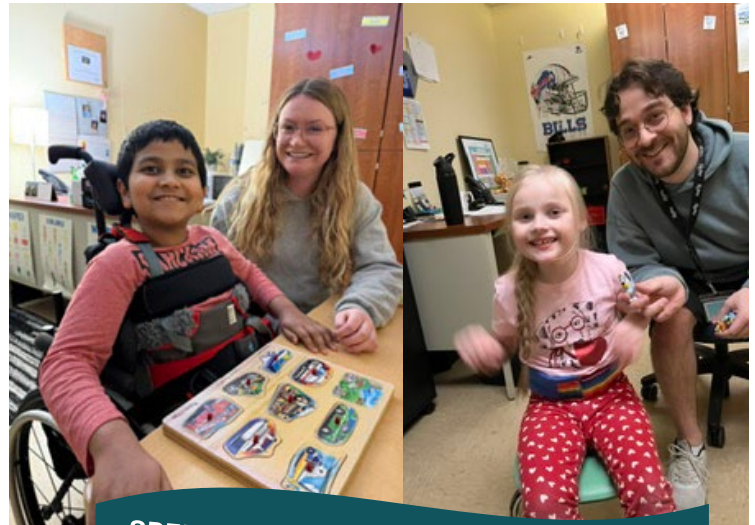
SPEECH-LANGUAGE & HEARING MONTH!

Our SLPs always work on helping our students accomplish the most that they can do within our classrooms and out in the community in regard to their communication skills.