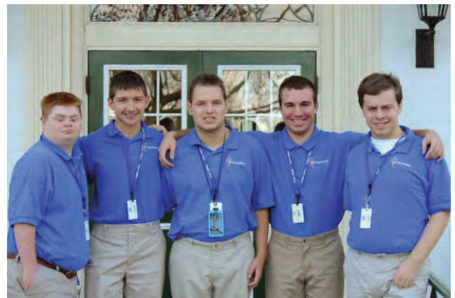
Project SEARCH participants are ready to work at Beechwood Continuing Care.

Project SEARCH™ combines real-life work experience with training in employment and independent living skills. Program interns are immersed in a series of job rotations allowing them to seek out positions that best suit their interests and skills. They are fully supported with accommodations, adaptations, and on-the-job coaching. Upon completion of the internship, they may have an opportunity to receive a job offer from Beechwood Continuing Care.