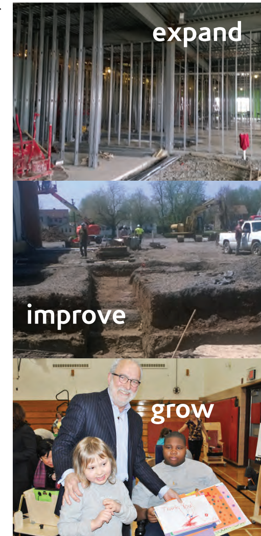
Top: Space being created for the new administrative wing.